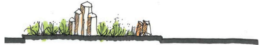
River Rock & Basalt